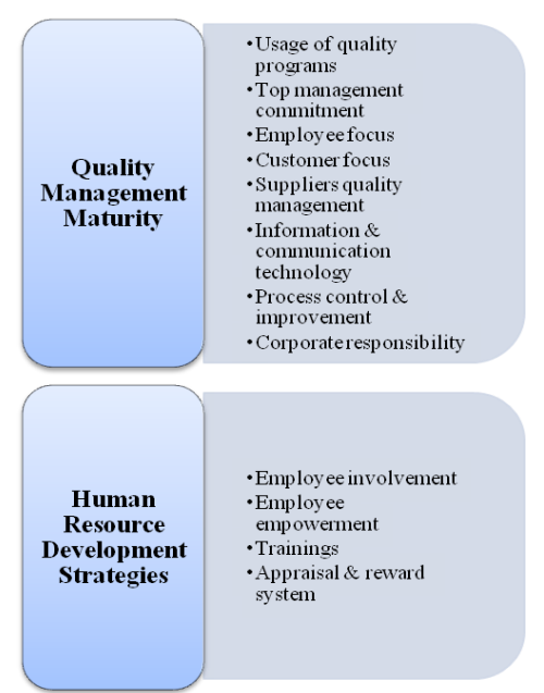
Figure 1 : Quality Management Maturity and Human Resource Development Strategies Constructs

Initially, based on the literature review, the constructs for quality management maturity and human resource development strategies were identified as shown in figure 1.