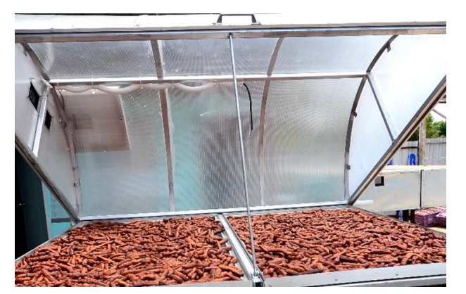
Fig. 4 Flavored sour tamarind cooked by the electric oven with solar energy