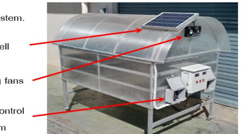
Fig. 3 Electric oven with solar energy

Knowledge and technology transfer to Duang Thona Community Enterprise, Phetchabun province in which 20 participants had 3-8 years of working experience in drying tamarind. The evaluation was in 3 aspects which the results of satisfaction as shown in Table 1. It was found that the overall satisfaction was 4.31±0.61 and the score was at a good level. When considering each aspect, the most average score was knowledge transferring with 4.39±0.58 and with a good level. Moreover, when summarizing the overall assessment of knowledge transfer of electric oven with solar energy, there were no points that were below the standard indicators (Key Results: KRs) of the project. It can show that the design and development of an electric oven in combination with solar energy to produce seasoned sour tamarind can meet the needs of the target audiences effectively [9].