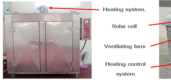
Fig. 2 The former three-phase electric oven

ISSN (Print): 1686-9869, ISSN (online): 2697-5548 DOI: 10.14416/j.ind.tech.2021.08.005